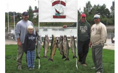
3 rd -No Limit