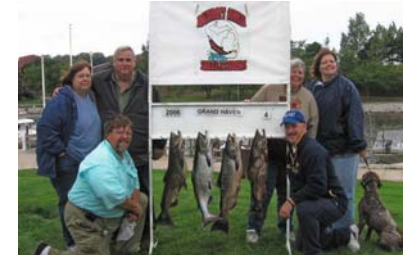
4 th -E Fish N Sea