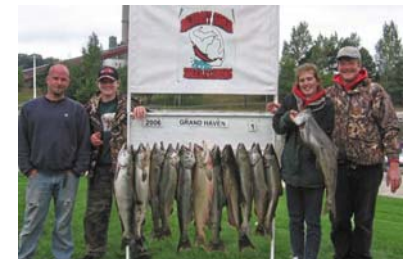
1 st -Pride & Joy

A total of 13 boats fished the tournament. Eleven boats weighed in at least one fish. The total number of fish caught was 49. Of these 46 were Kings and 3 were Coho. The Big Fish was a 17.95# King caught by Pride & Joy. They were also the $65.00 Big Fish Pool winner. 11th Lucky Strike (Ron) 11.05 10th Dredge 16.75 9th TNT 24.10 8th Silver Addiction 38.75 7th Sloppy Joe 53.15 6th Thors Hammer 56.10 5th Vicki's Seacret 62.10 4th E Fish N Sea 71.15 3rd No Limit 101.15 2nd Bobby's Toy 109.85 1st Pride & Joy 151.70