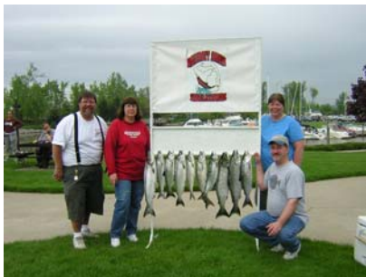
Capt'n Hook II